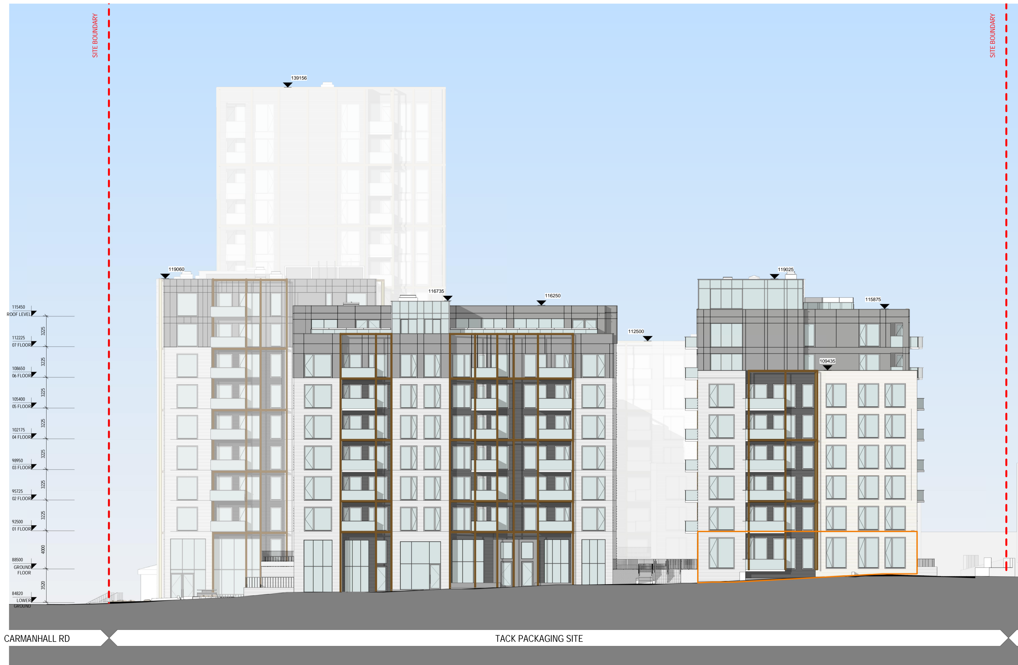
1 PROPOSED NORTH WEST ELEVATION - TACK SITE 1:200